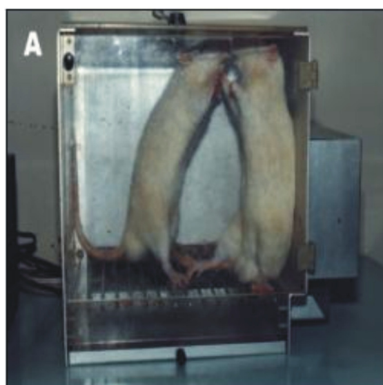
Fig. 1 – The animals maintaining evident physical contact.

The animals aged 90 days, weighing 310-330g, were evaluated with regard to aggressiveness behavior, using Skinner box with footshock. In this model each stimulus (an electric footshock) consisted of a 1.6-mA - 2-s current pulse. Each session lasted 20 min and included 5 stimuli separated by a 4-min interval. During the first 3 min of this interval, the duration of the aggressive response was measured with a digital chronometer. The total time of aggressive behavior observation was 900 s. In the last minute of each interval, the data were recorded and the equipment was checked. The aggressive response was defined as the presentation of at least one of the two following behaviors: a) the animals stood up on the hind paws facing each other in a threatening attitude but without direct contact ( Fig. 1 ) or b) they maintained evident physical contact (scratching, tooth baring and emission of characteristic vocalization) ( Fig. 2 ).